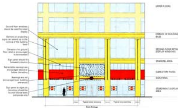
BUILDING ELEVATION Example: State Street elevation of The Boston Store

(TOTAL SIGN AREA ALLOWED) - 4 TIMES (ON E.P.), THE LINEAL FRONTAGE OF THE BUILDING (IN FT.)